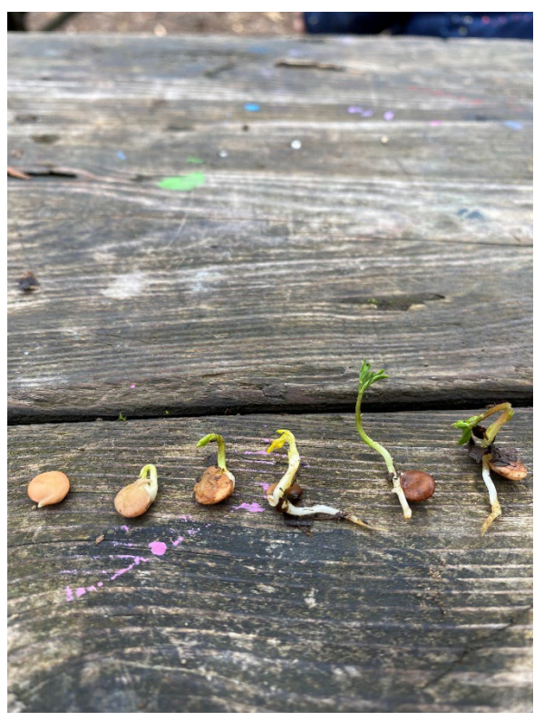
Observing the progression of seed growth