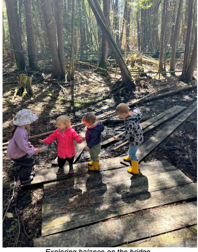
Exploring balance on the bridge