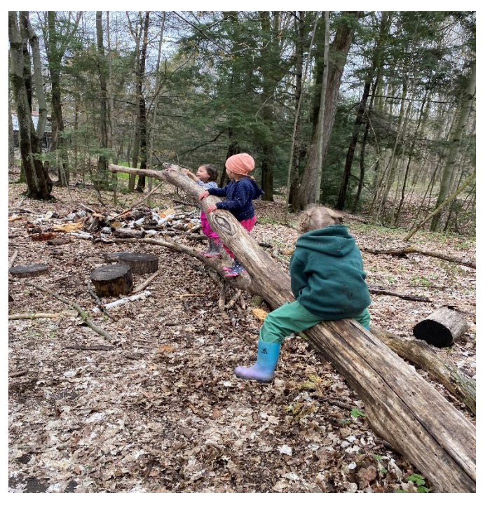
Climbing on logs with friends – multiple skills developing