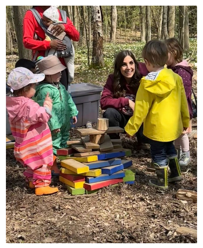
Doe and the DMC Travel Tots had lots of fun building!