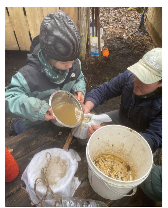
Filtering collected dirt into clay