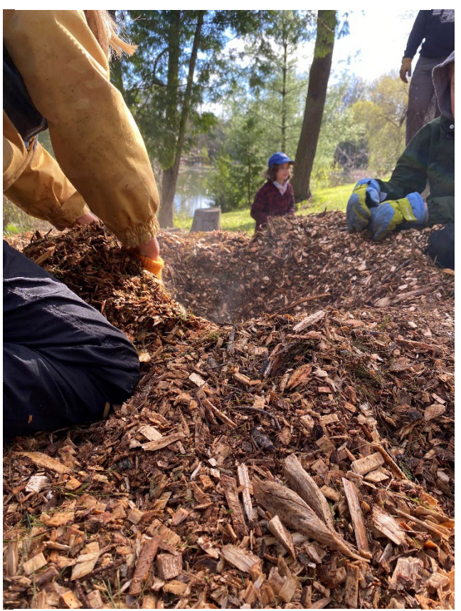
More heat exploration when forest schoolers dug down into the wood chips and felt it to be warmer