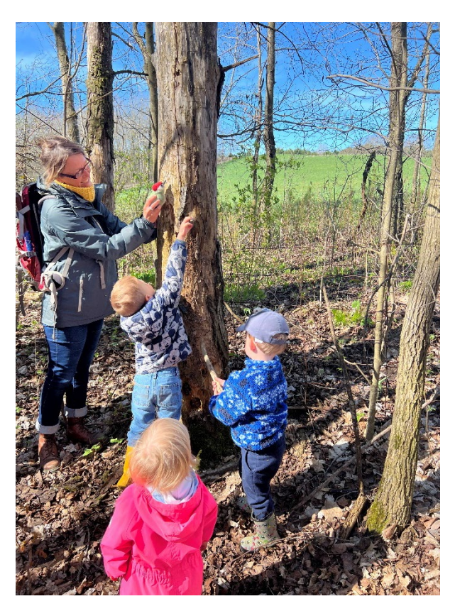
Scooter showing us how Wood Peckers move up and down the tree searching for bugs to eat