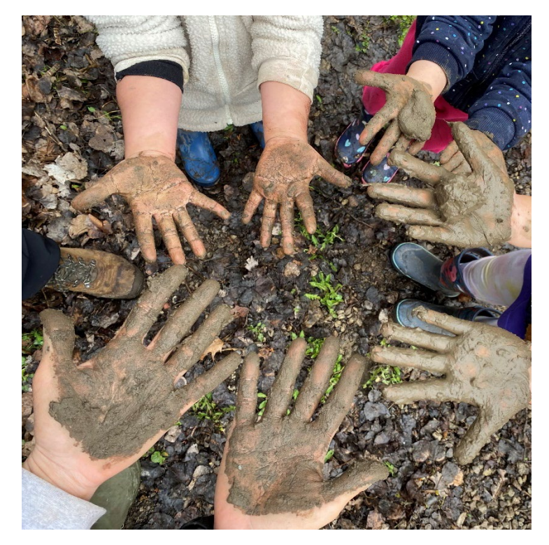
Muddy hands are fun!