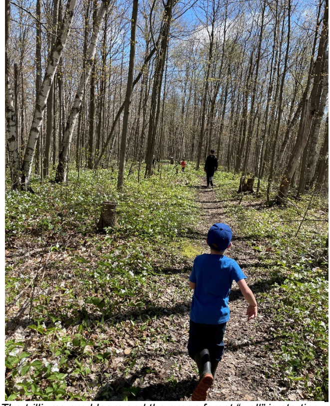
The trilliums are bloom and the green forest "wall" is starting to fill in