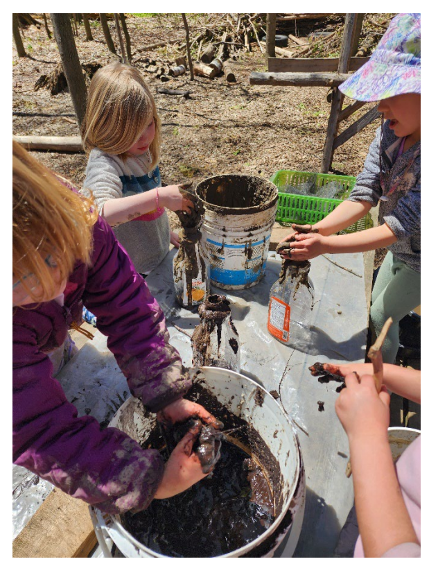
Broke up the chunks of dirt to remove rocks and begin the refining process