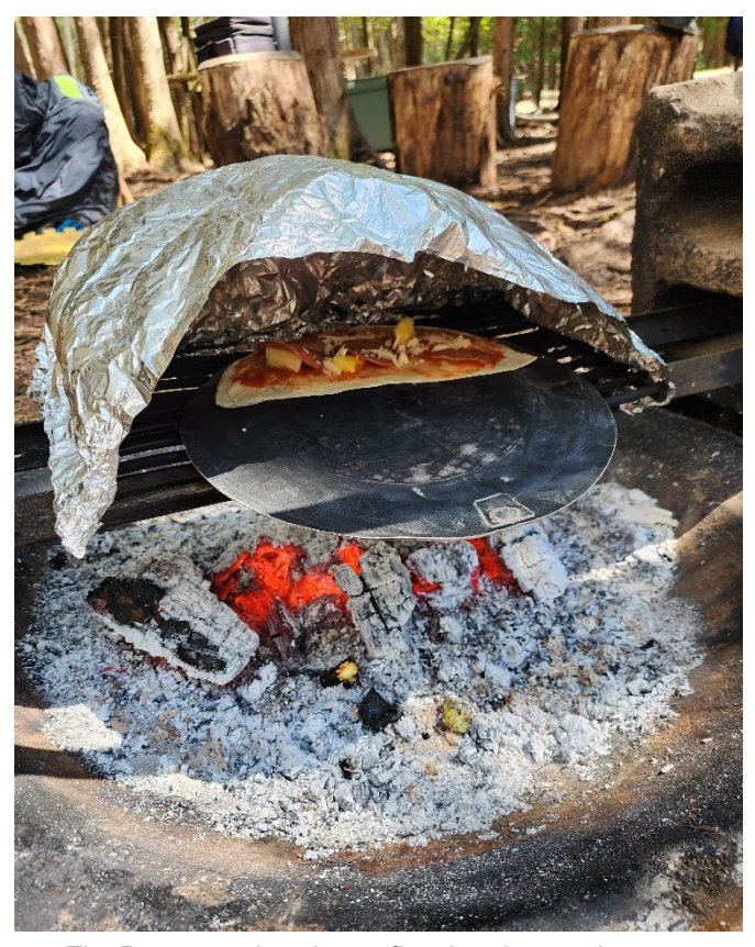
The Rangers enjoyed campfire pizza by creating a tin foil oven