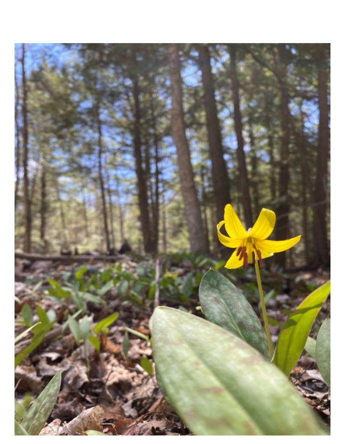
A trout lily flower