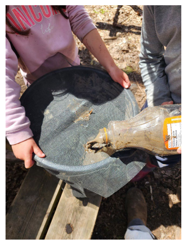
Filtration through some screening