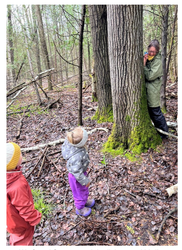
We found Scooter and the little sound bird!