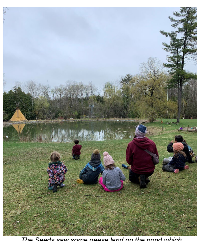
The Seeds saw some geese land on the pond which caught their interest and attention