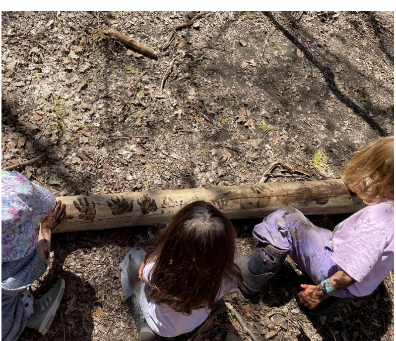
Mud painting with hands continues!