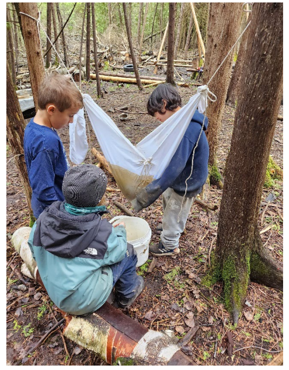
Exploring other strategies for filtration