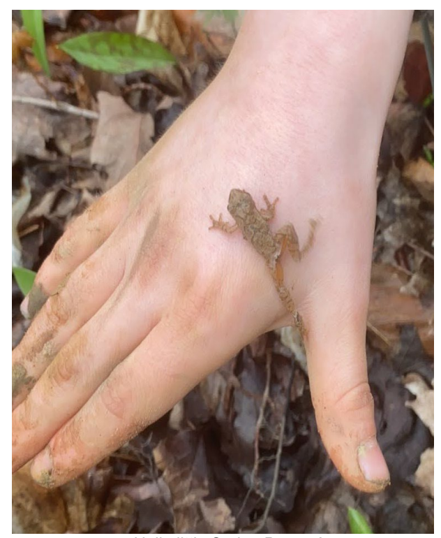
Hello little Spring Peeper!