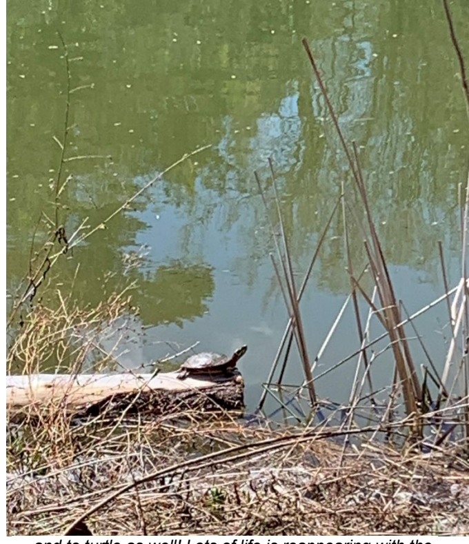
...and to turtle as well! Lots of life is reappearing with the warmer weather!