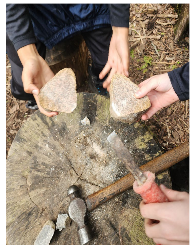
Smashing rocks to see what is inside