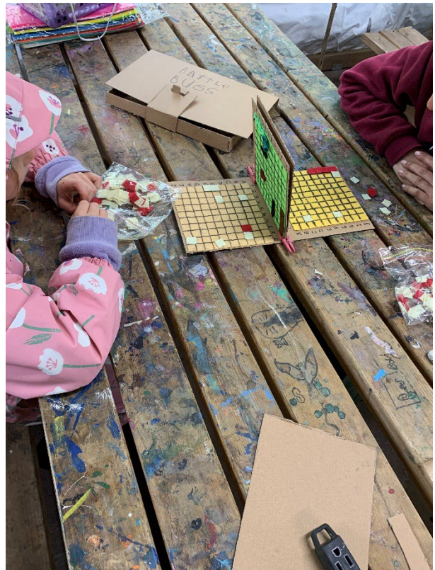
Playing "Battle Bugs" – the game board was created by some forest schoolers