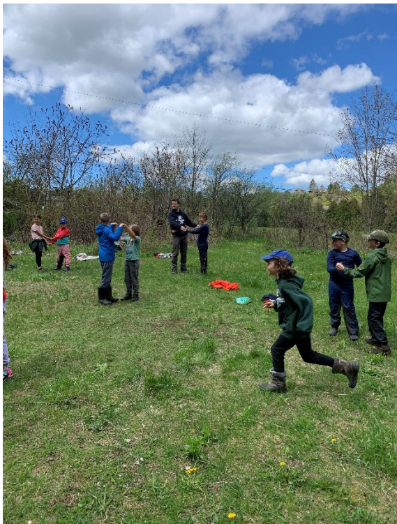
A fun game of Rabbit & Fox at the Berry Patch