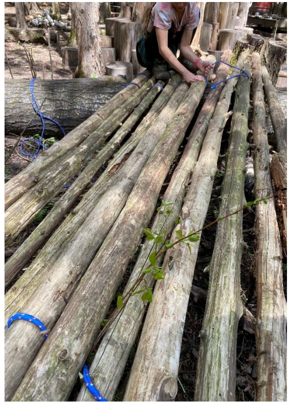
Weaving cedar poles together for a fort