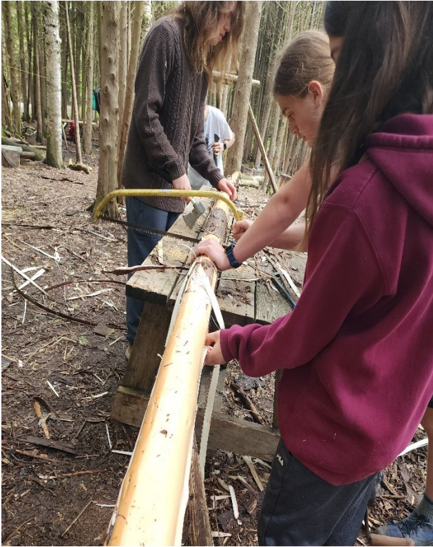
Peeling bark off cedar logs for our garden poles helps reduce rate of rot