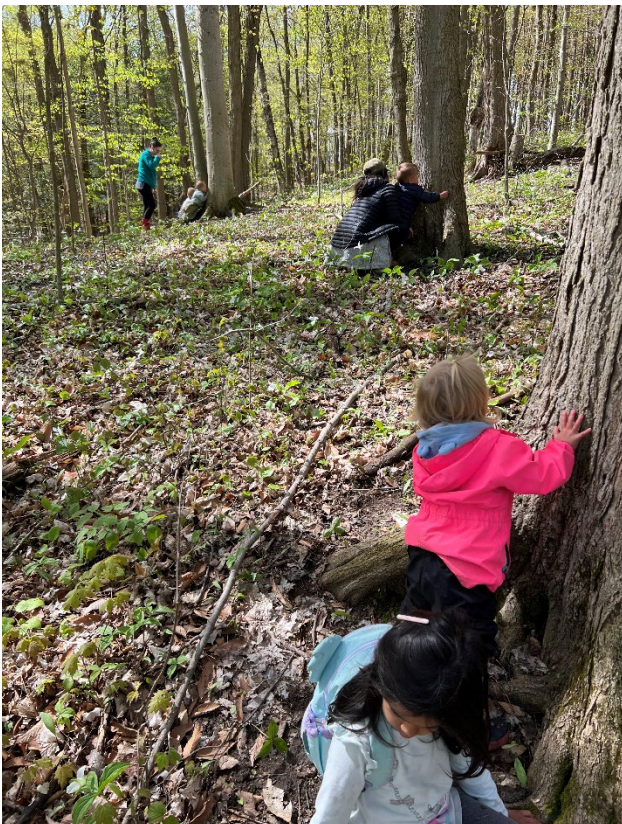
Playing hide and seek with Scooter