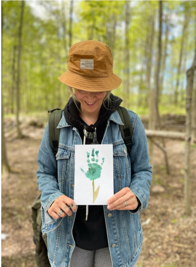
Forest School Mom with her mud paint handprint flower - Happy Mother's Day!