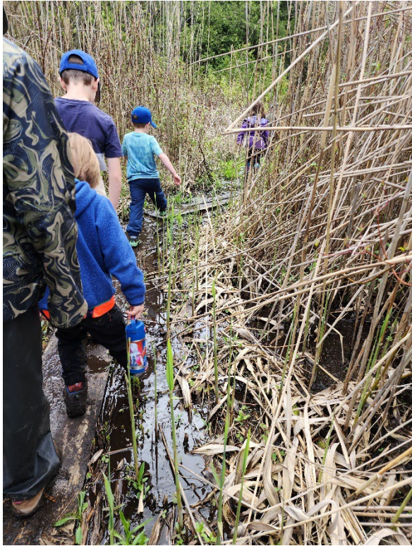
Exploring the Marsh Trail