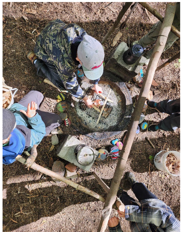
Cooking over the fire always brings friends together