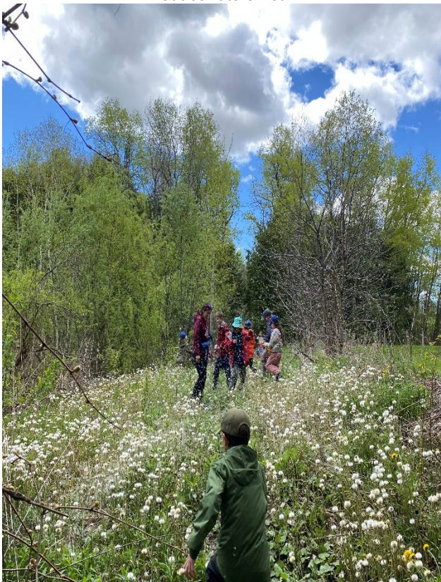
Exploring the Berry Patch