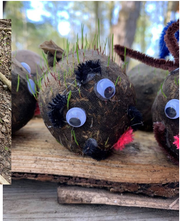
Our grass buddies are sprouting hair!