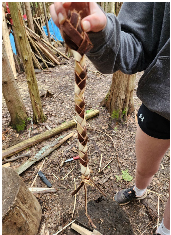
Cedar bark braiding