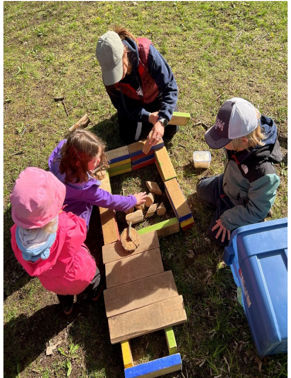
Getting creative with blocks