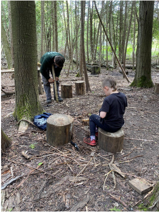
Working on whittling a baseball bat