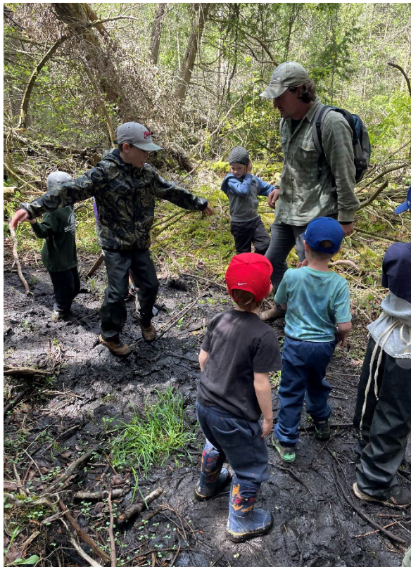
Avoiding the mud crocodiles while exploring the squishy nature of mud