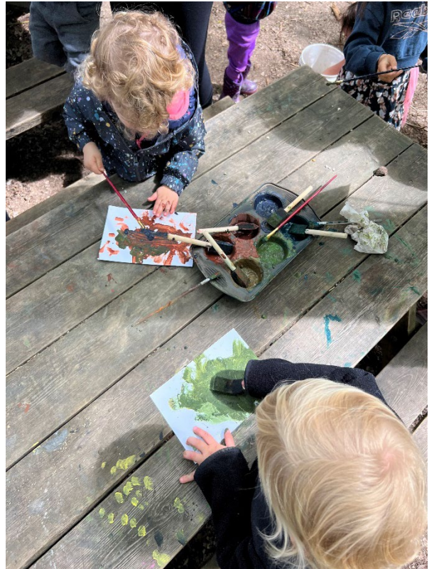
Mud painting with the Roots & Shoots – some handprints, some abstract art