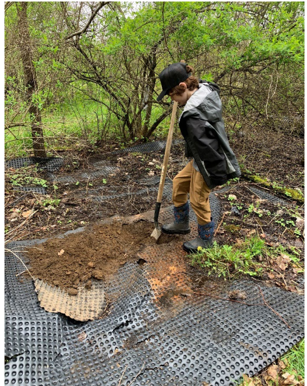
Making room for a new baby Oak tree to be planted