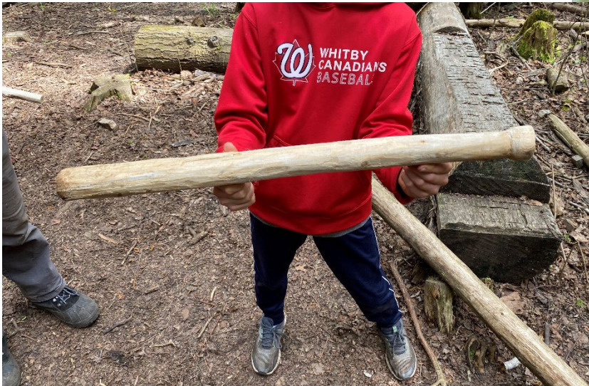
A hand whittled baseball bat – functional too!