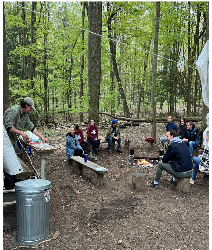
Fireside Chat ft. a snack break with Mosquito making pizza roll ups – good company & good food!